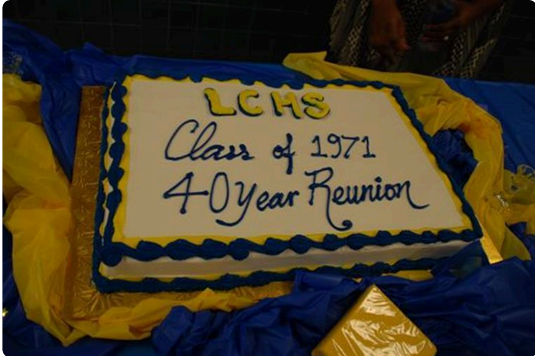
The Class of 1971